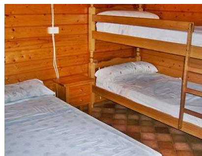
View of the bedroom