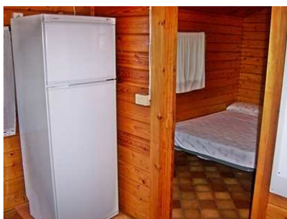
View of the kitchen and the bedroom