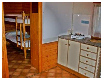
View of the kitchen