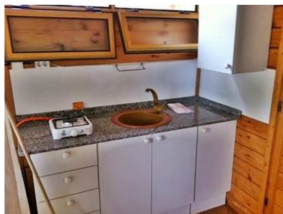
View of the kitchen with sink