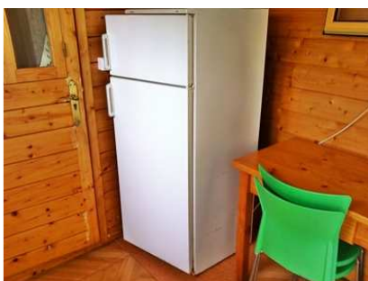
View of the kitchen