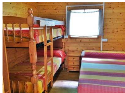
View of the bedroom